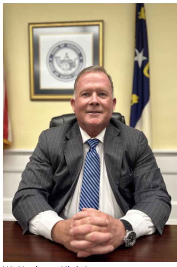
W. Hackney High Jr. Mayor Email

The Edenton Town Council meets in regular session on the second Tuesday of every month and for committee meetings on the fourth Monday of every month. The Town Council meets at the Council Chambers located at 504 South Broad Street. Meetings begin at 6:00 p.m.